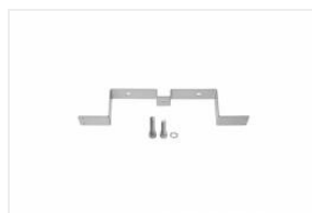
OCULUS LED - surface mounting handle (964893)