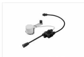
OCULUS LED - motion and dusk sensor (964244)