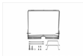
OCULUS LED - universal handle (964886)