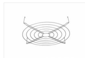
OCULUS LED - protective grid (964862)