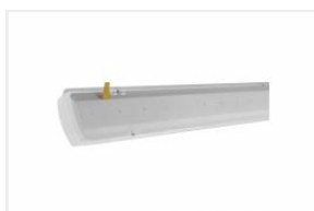
ATLAS LED 1450mm 6000lm 840 - moduł świetlny (952036)