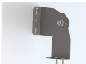
TYTAN LED, ATLAS LED, INDUSTRY LED - uchwyt regulowany (kpl. 2 szt.) (908200)