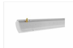
ATLAS LED 1150mm 4500lm 840 - moduł świetlny (952029)